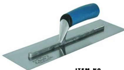
ITEM NO. 13-412G